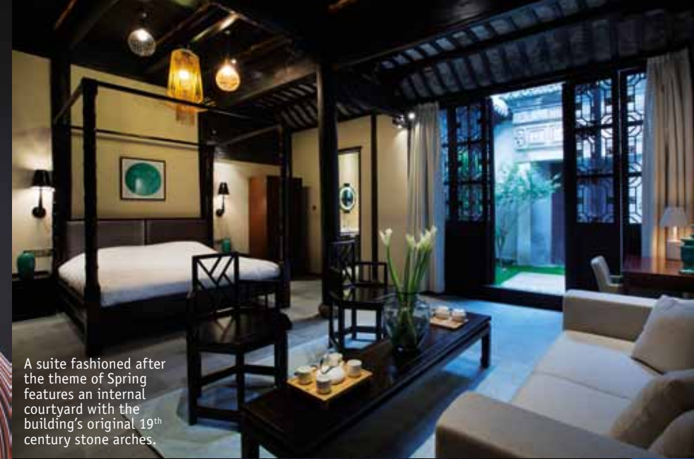
A suite fashioned after the theme of Spring features an internal courtyard with the building's original 19th century stone arches.