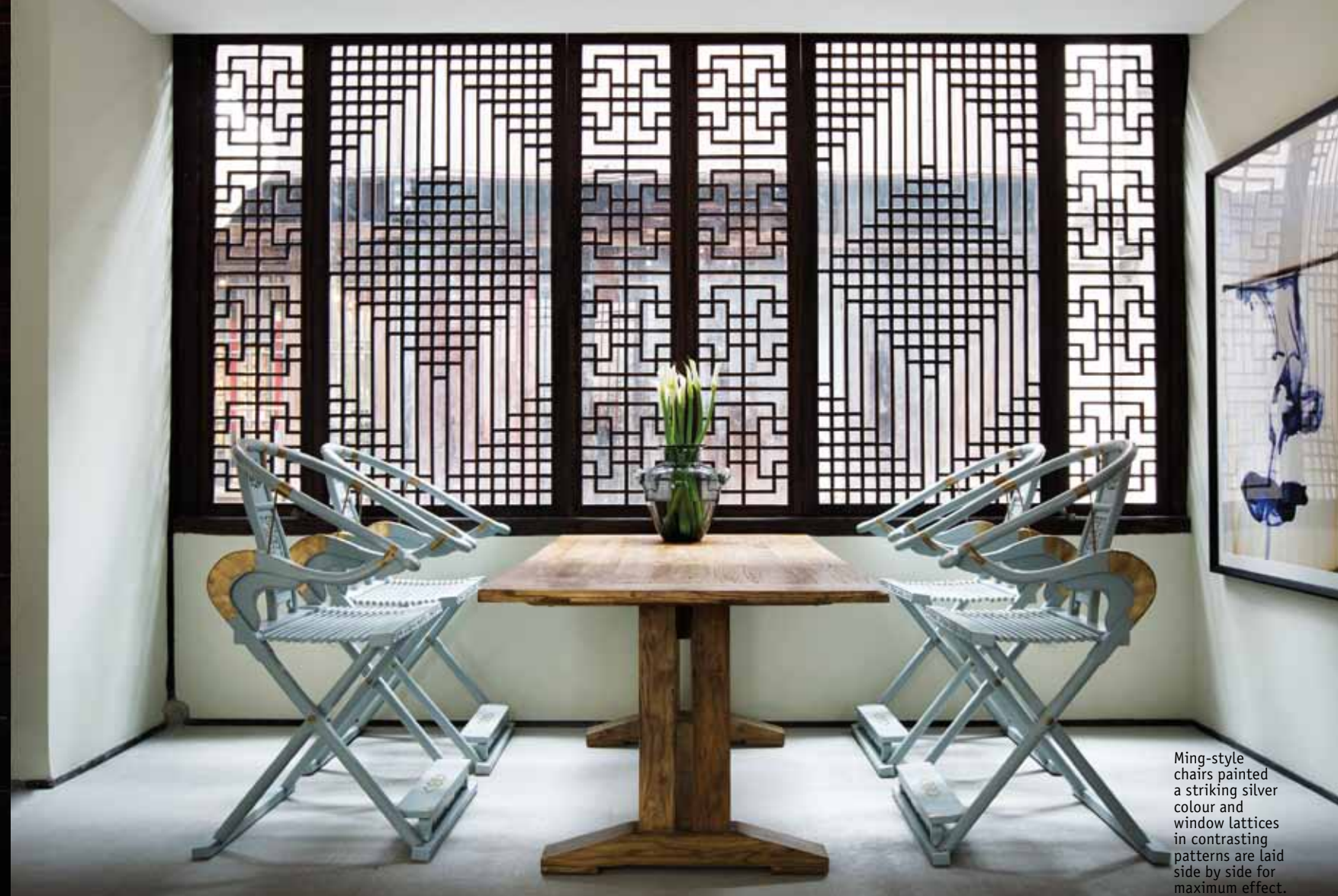
Ming-style chairs painted a striking silver colour and window lattices in contrasting patterns are laid side by side for maximum effect.

F ramed by willow trees and perfectly rounded, carved stone bridges, picturesque canals characterise the ancient town of Zhouzhuang, 50 kilometres from Shanghai. Here, time seems to stand still, and life has remained the same for centuries: villagers still wash clothes in the waterways and gather over tea under the graceful upturned eaves of its classical Ming and Qing dynasty courtyards.