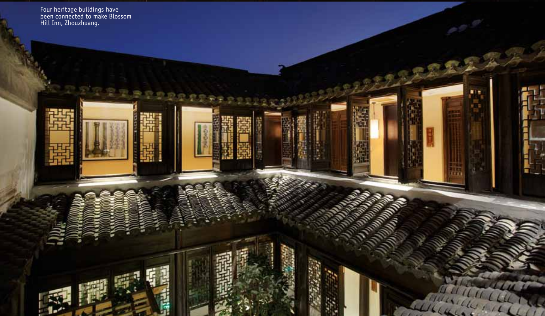
Four heritage buildings have been connected to make Blossom Hill Inn, Zhouzhuang.