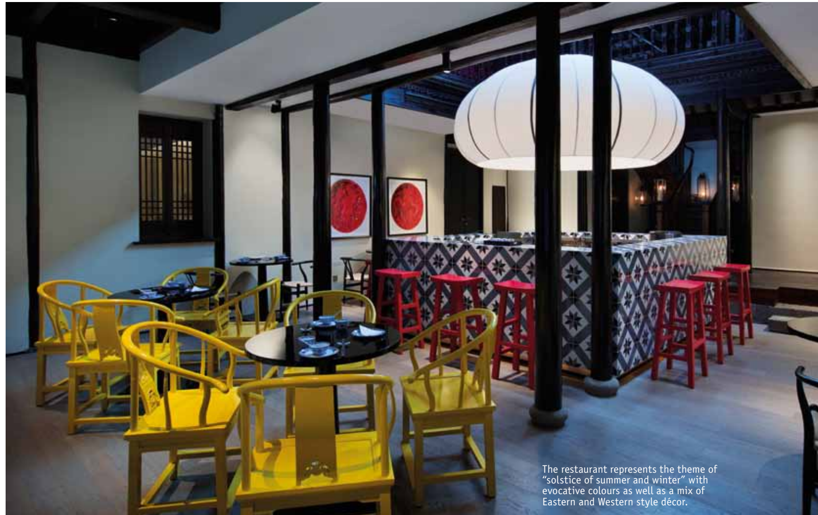
The restaurant represents the theme of "solstice of summer and winter" with evocative colours as well as a mix of Eastern and Western style décor.