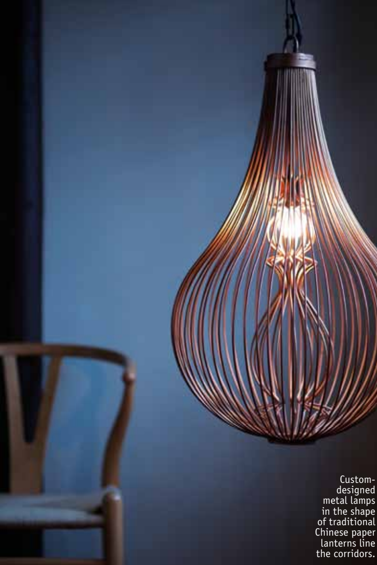
Custom-designed metal lamps in the shape of traditional Chinese paper lanterns line the corridors.