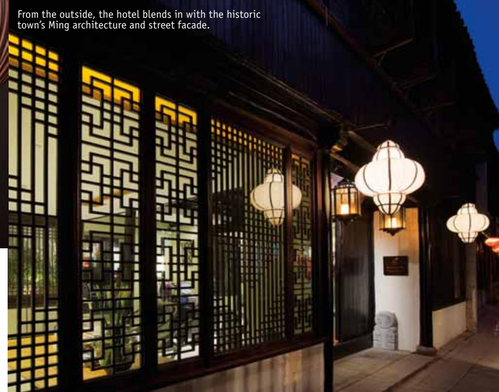
From the outside, the hotel blends in with the historic town's Ming architecture and street facade.

"I happened to be reading about it in a book on Chinese history and found it interesting and appropriate—each 'moment' could be defined by different colours, materials and styles."